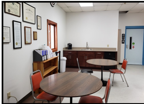
New Internet Café Relax and enjoy access