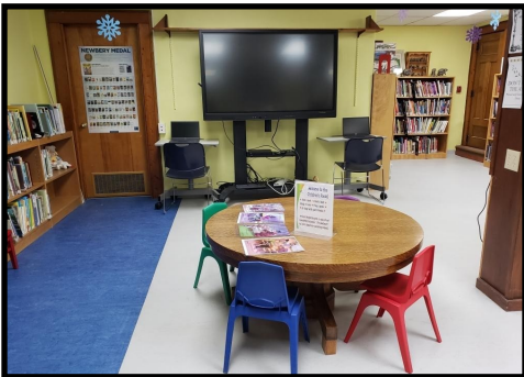
New Children's Presentation Area