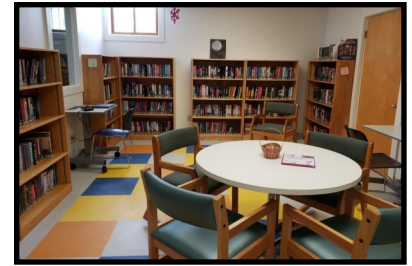
New Teen Room

12-21-2020 The arched windows from the 1920 building decorate the wall of the addition.