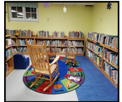
New Children's Room